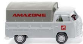
0316 02 VW T2 with tarpaulin