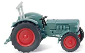
0871 41 Eicher Königstiger

W IKING is celebrating the 50th anniversary of the legendary British roadster being launched onto the market: 50 years of the Jaguar E-type which has become synonymous with the stylish tradition of English sports cars. Alongside it stands the intricately detailed classic Eicher Königstiger tractor that tracks the nuanced colourways of the former tractor manufacturer. Another vehicle making a reappearance is a dumper trailer which is more than four decades old. WIKING has breathed new life into the historic moulds for this trailer while at the same time producing a trailer that can be used with the Hanomag truck from its range of new models on offer. The Unimog U20 and