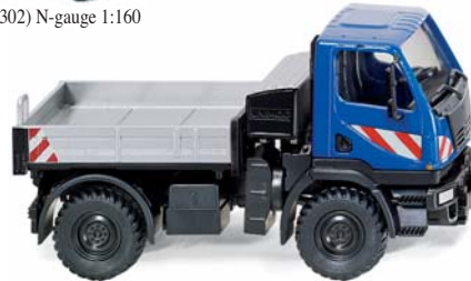
0369 02 Unimog U20