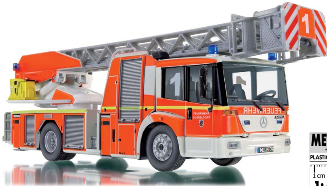
0431 02 Turntable ladder L32 (MB Eonic) fire truck