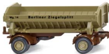
0850 49 Hanomag with dumper trailer