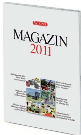
0006 18 WIKING magazine 2011

W IKING is celebrating the 50th anniversary of the legendary British roadster being launched onto the market: 50 years of the Jaguar E-type which has become synonymous with the stylish tradition of English sports cars. Alongside it stands the intricately detailed classic Eicher Königstiger tractor that tracks the nuanced colourways of the former tractor manufacturer. Another vehicle making a reappearance is a dumper trailer which is more than four decades old. WIKING has breathed new life into the historic moulds for this trailer while at the same time producing a trailer that can be used with the Hanomag truck from its range of new models on offer. The Unimog U20 and