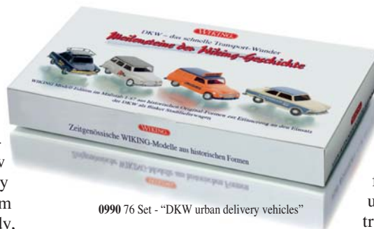
0990 76 Set - "DKW urban delivery vehicles"

Model enthusiasts have been waiting for this special vehicle for a very long time: now, for the first time, WIKING has created a model of the Metz B32 fire truck as a fully functioning precision model in 1:87. WIKING's significant investment in the new moulds required has definitely paid off which is clear to see from the intricate detailing on the body, not least the telescopic turntable and rescue cage. The new models on offer include a limited edition contemporary themed set of DKW vehicles that looks back at the everyday suitability of the Universal and the Junior as speedy urban delivery vehicles. Car enthusiasts will be delighted with the new