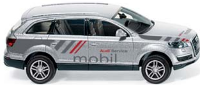
0133 05 Audi Q7