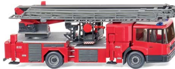
0628 49 Metz B32 (MB Eonic) fire truck