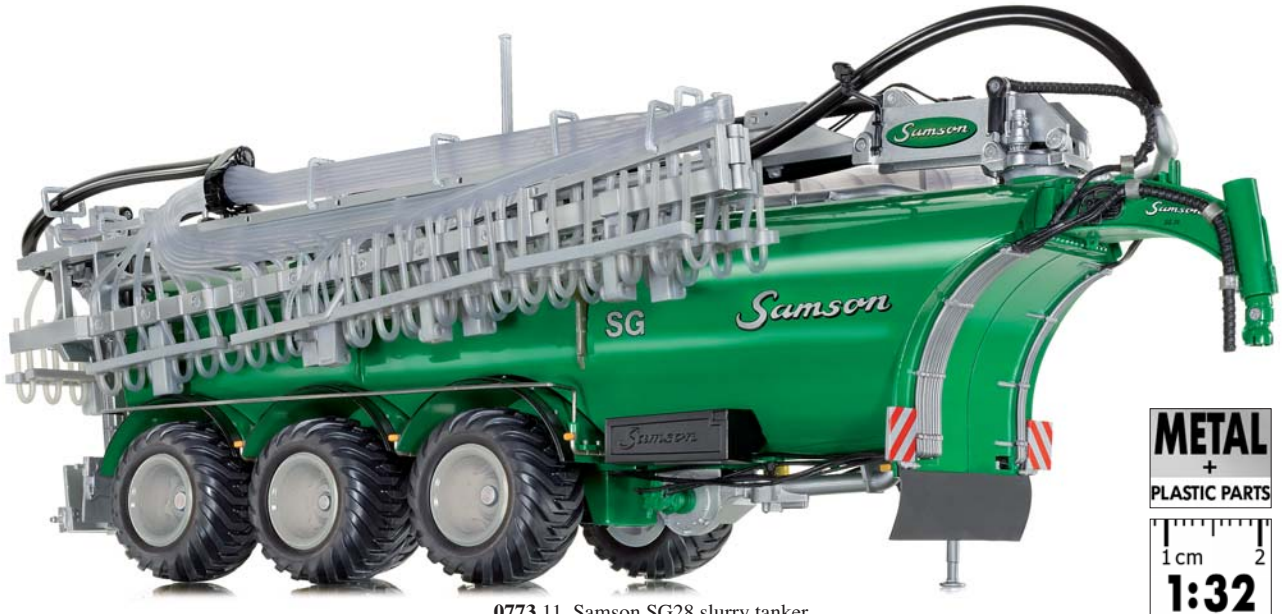
0773 11 Samson SG28 slurry tanker