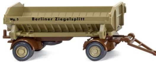
0675 49 Dumper trailer