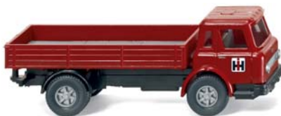
0446 01 Flatbed truck (International Harvester)