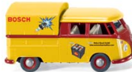
0789 03 VW T1 twin cab with tarpaulin