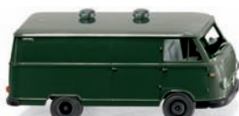
0270 48 Borgward B611 box van