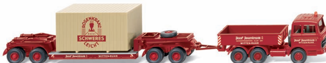
0504 01 MB LP 2223 Heavy freight vehicle