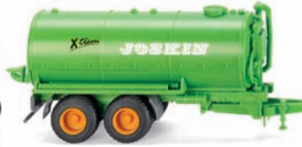
0382 39 Joskin vacuum tanker