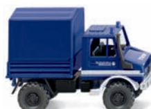
0693 16 TES - Unimog U 1700 with tarpaulin