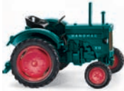
0885 04 Hanomag R16