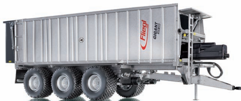
0773 13 Fliegl ASW288 dumper truck with tailgate