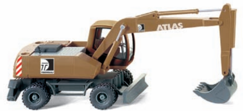
0661 02 Atlas 2205M mobile excavator