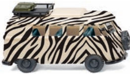
0797 09 VW T1 "Safari" campervan