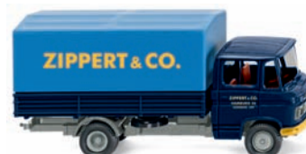
0271 01 MB L 408 Flatbed truck

Two new 1:87 classics represent an important step towards the attainment of milestones in WIKING's history: the '64 Ford Mustang and the Glas 1700 GT cabriolet will fulfil the long-cherished desires of collectors just in time for Christmas! These are joined by the Borgward B611 with its intricately detailed interior in the form of a prison van and the Opel Kapitän as a police patrol car. Other newcomers to the range include the TES Unimog U1700 along with the VW Caddy serving the Berlin Fire Service as well as the MB L 408 in the service of the Zippert haulage company and the LP 2223 heavy freight truck of