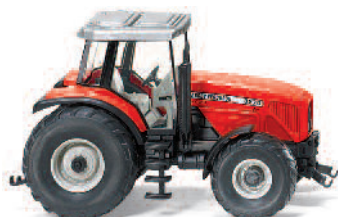
0385 05 Massey Ferguson MF 8270