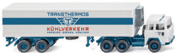
0528 49 Articulated truck with refrigerated trailer (Magirus 235 D)

Both are classics which are inextricably linked with the post-war history of Germany: WIKING's new models for August include the Glas Goggomobil with folding roof in filigree detail and the Ford FK 1000 as a box van. Thanks to the typical craftsmanship of WIKING, both of these new models display intricate detail and high-quality finishing. Other newcomers to the summer range include the Ford Granada as a police vehicle and the Magirus 235 D as