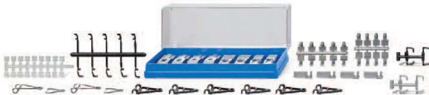
0018 05 Set of accessories - couplings