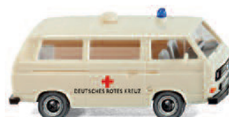
0320 02 German Red Cross - VW T3 van