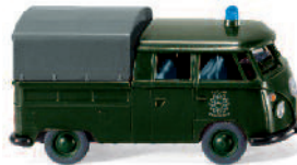
0864 19 Police vehicle - VW T1 twin cab with tarpaulin