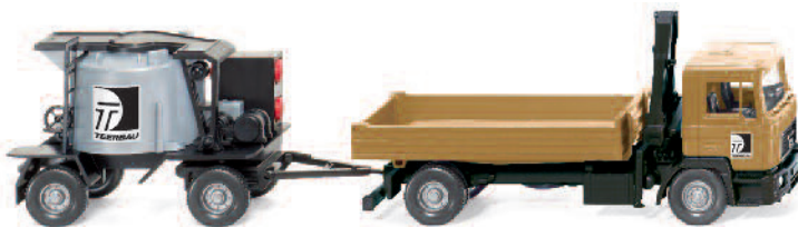
0689 03 Poured asphalt mixer truck-trailer combination (MAN F 90)