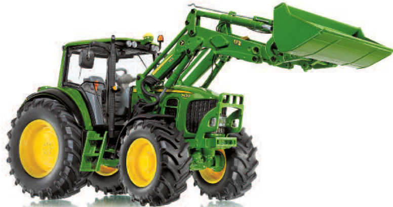
0773 09 John Deere 7430 with front loader