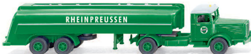
0882 49 Articulated tanker truck (Büssing 8000)

W IKING's model upgrades bring together four decades of automobile history and the eras are represented in all their facets in an exciting range of models. The Büssing 8000 articulated tanker truck joins the range in the livery of legendary petrol company "Rheinpreussen" while the Ford Lincoln Continental and the Mercedes Benz Pagode as seasoned chrome classics hark back to the 1960s.