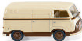
0289 01 Ford FK 1000 box van