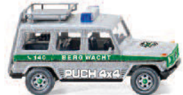
0278 03 Puch G