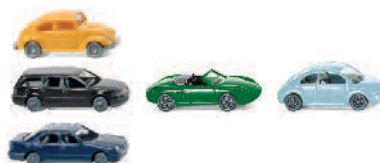
0918 08 Mixed set of 3 different cars N-gauge 1:160