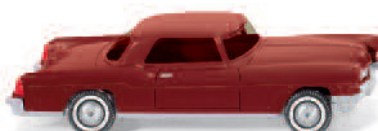
0210 01 Ford Lincoln Continental